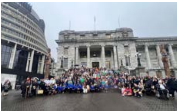
Ngāti Tama uri alongside Taranaki Whānui at the final reading of the Mounga Redress

We had 26 register with Ngāti Tama this year to attend the final reading for the Mounga redress and 20 entering Parliament. We stayed at Pipitea Marae alongside many whanaunga who made the haerenga with us from Taranaki. Through our collective strength, we were able to reinstate the mana of Koro Taranaki and revitalise our voice as tāngata whenua.