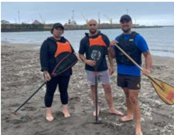
Iwi Sports Day