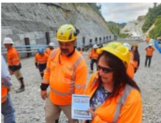
Tunnel first cut up at Te Ara o Te Ata