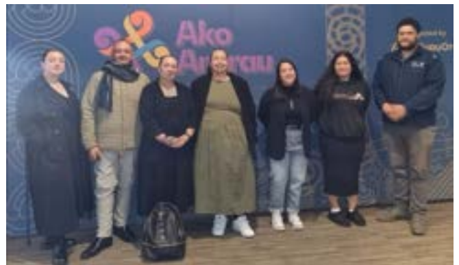
Rūnanga staff on PD with Ngāti Rāhiri hapū, Hapū Wānanga and Ngāti Mutunga at Ako Ararau