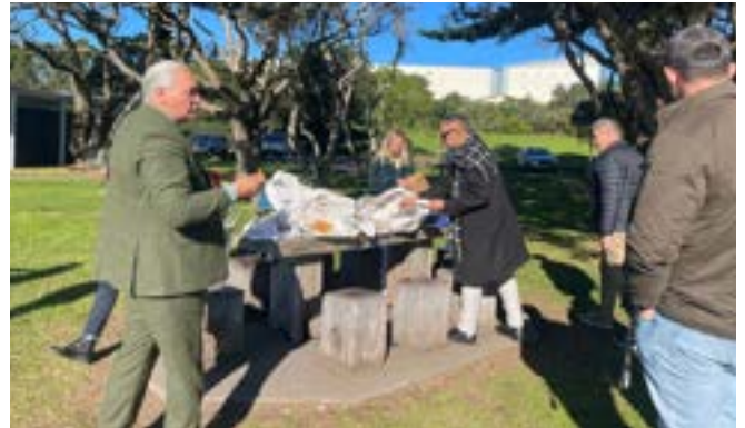
Rūnanga staff celebrating Puanga mā Matariki with Te Kāhui o Maru Wharanui

Together, these relationships have helped us build a resilient foundation for Ngāti Tama - one that reflects our shared aspirations, honors our tikanga, and empowers our whānau for generations to come.