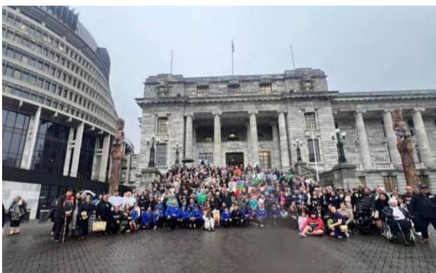
Ngāti Tama uri alongside Taranaki Whānui at the final reading of the Mounga Redress

We had 26 register with Ngāti Tama this year to attend the final reading for the Mounga redress and 20 entering Parliament. We stayed at Pipitea Marae alongside many whanaunga who made the haerenga with us from Taranaki. Through our collective strength, we were able to reinstate the mana of Koro Taranaki and revitalise our voice as tāngata whenua.