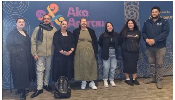
Rūnanga staff on PD with Ngāti Rāhiri hapū, Hapū Wānanga and Ngāti Mutunga at Ako Ararau