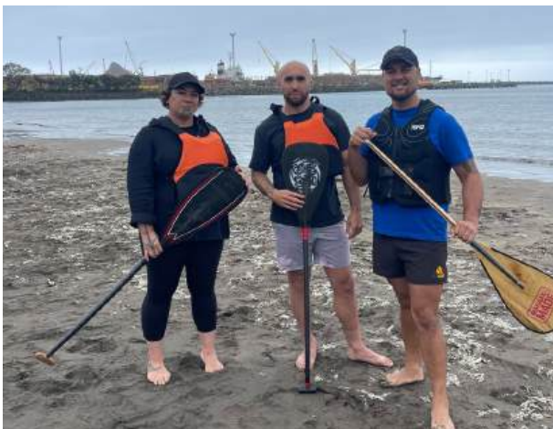
Iwi Sports Day