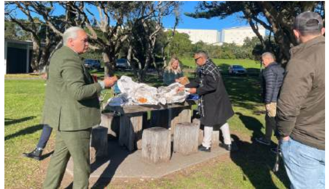
Rūnanga staff celebrating Puanga mā Matariki with Te Kāhui o Maru Wharanui

Together, these relationships have helped us build a resilient foundation for Ngāti Tama - one that reflects our shared aspirations, honors our tikanga, and empowers our whānau for generations to come.