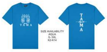
NGĀTI TAMA - TŪ MAI REGO TSHIRT

We were able to ensure that each person that registered with us this year would get a free shirt.