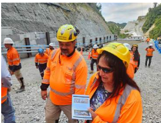
Tunnel first cut up at Te Ara o Te Ata